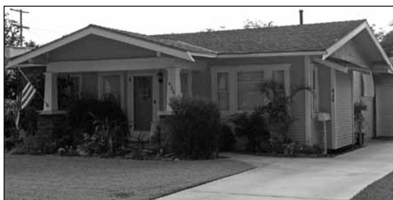
Pacific Ready-Cut Home at 426 W. Malvern.

pany workers or local carpenters to erect the home or choose to do it themselves. Homebuyers could also hire just an expert working foreman from Pacific for $8.50 a day, plus rail fare or carfare, and room and board. Skilled carpenters typically charged $400 to $750 to erect