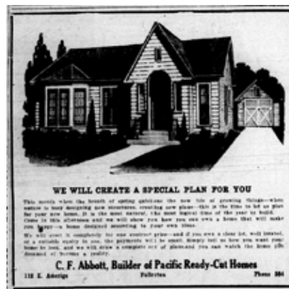
1929 Advertisement for a Ready-Cut Home from the Fullerton News Tribune.

a kit home. Onsite, the houses were assembled – not constructed – quickly in three to 30 days, depending upon the size of the home and how many workers were on hand. In the first phase, the sections of the home would be nailed together, including the roof. Finishing touches were added in the final phase.