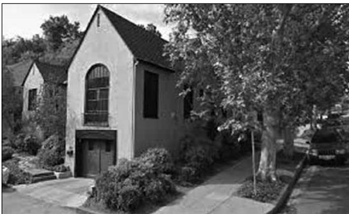
Roy and Walt Disney's matching Kit Homes

Homeowners are discovering the charm of kit homes, drawn to the early 20 th century homes, unlike any other residence on the block or even in town. Kit homes are now highly prized by history buffs who appreciate living in a part of American architectural history. If the house can be documented as being a kit home, the value of the property will be enhanced, especially if interior and exterior features are original.